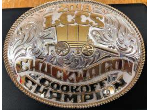
The C Bar C Chuckwagon team received this belt buckle as one of their prizes for winning first place at the World Championship Chuckwagon Cook-Off.

The cook-off was held as part of the Lincoln County Cowboy Symposium that took place this year from October 12-14. The symposium is an annual event in Ruidoso and includes a number of different performances and competitions.