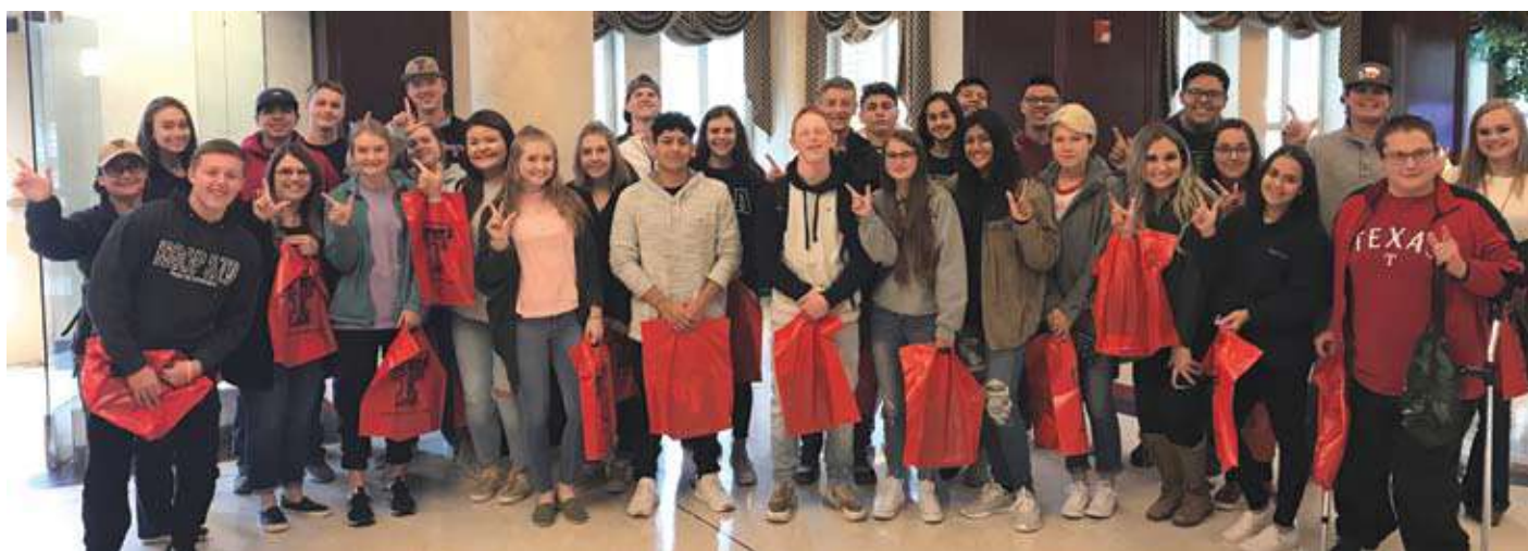
These Dalhart High juniors and seniors took a trip to visit Texas Tech University on Wednesday October 17.