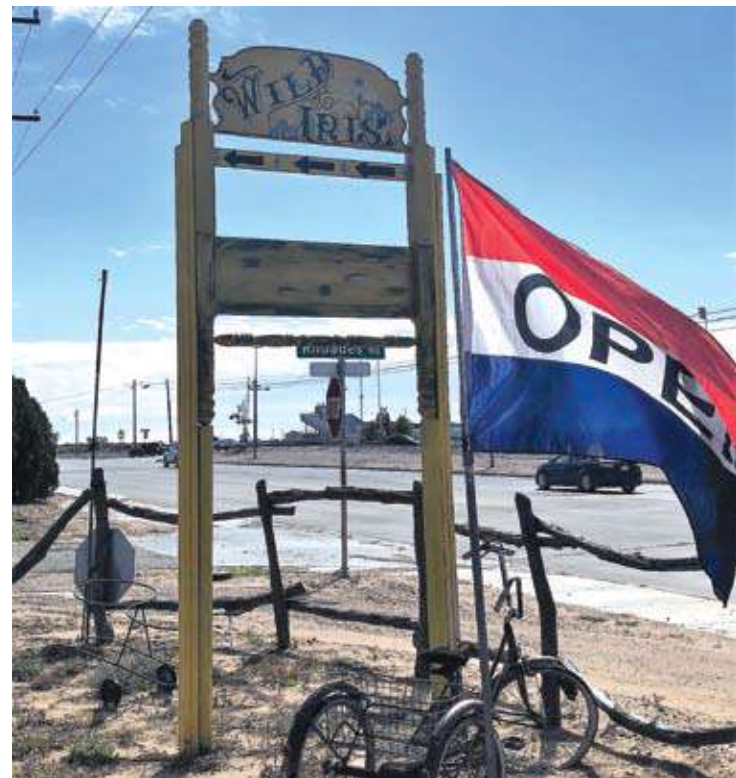
Wild Iris Antiques is located on Highway 87/385 just north of 16th Street.