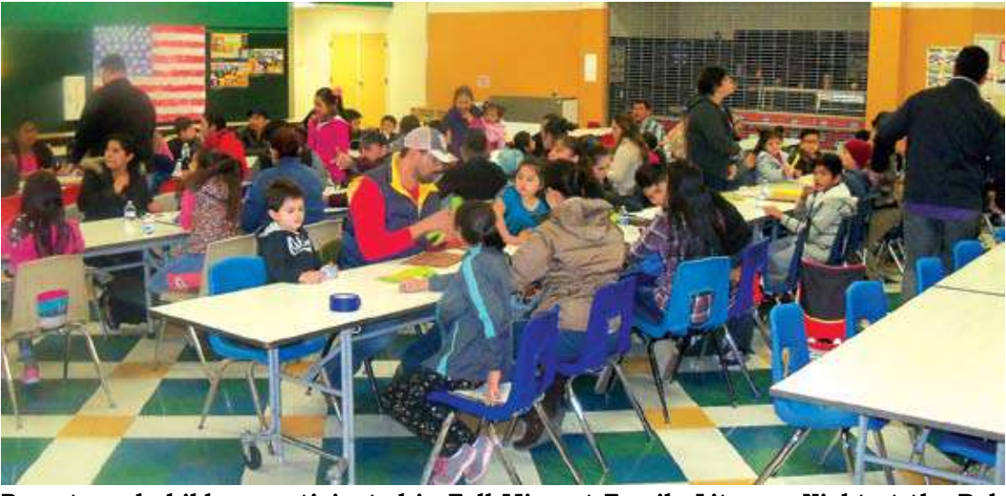
Parents and children participated in Fall Migrant Family Literacy Night at the Dalhart Elementary School cafeteria last week.